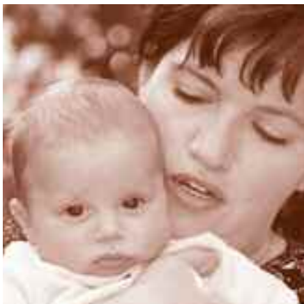
For 90 years, Catholic Charities' Prenatal Services has provided medical care and supportive services to low-income women

Committed to helping families in need, the parish holds two community baby showers each year to collect basic necessities for impoverished women seeking help at Catholic Charities' Prenatal Services.